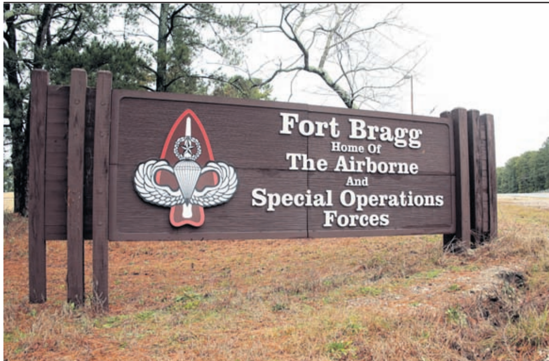
In this Jan. 4, 2020, file photo a sign for at Fort Bragg, N.C., is shown.